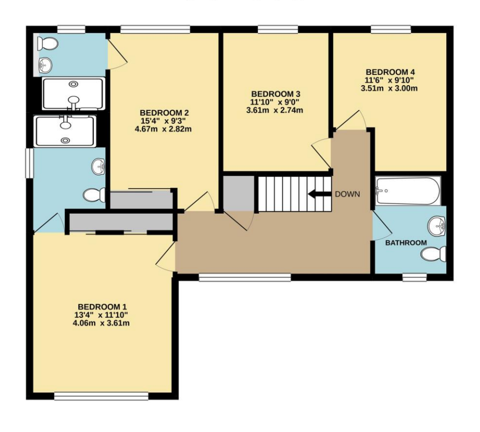
1ST FLOOR 809 sq.ft. (75.2 sq.m.) approx.