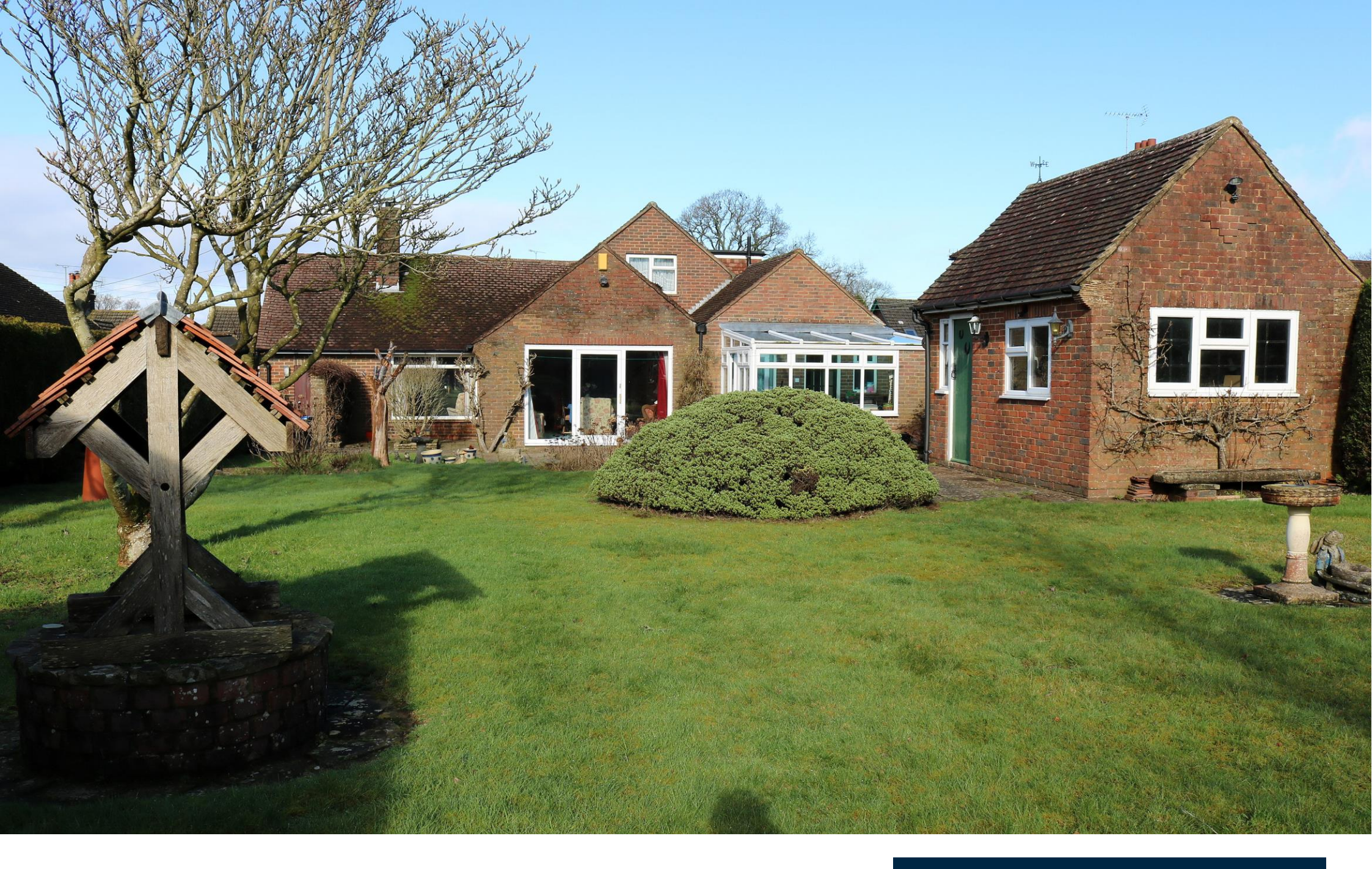
Talgarth Horsham Road, Handcross, West Sussex. RH17 6DH