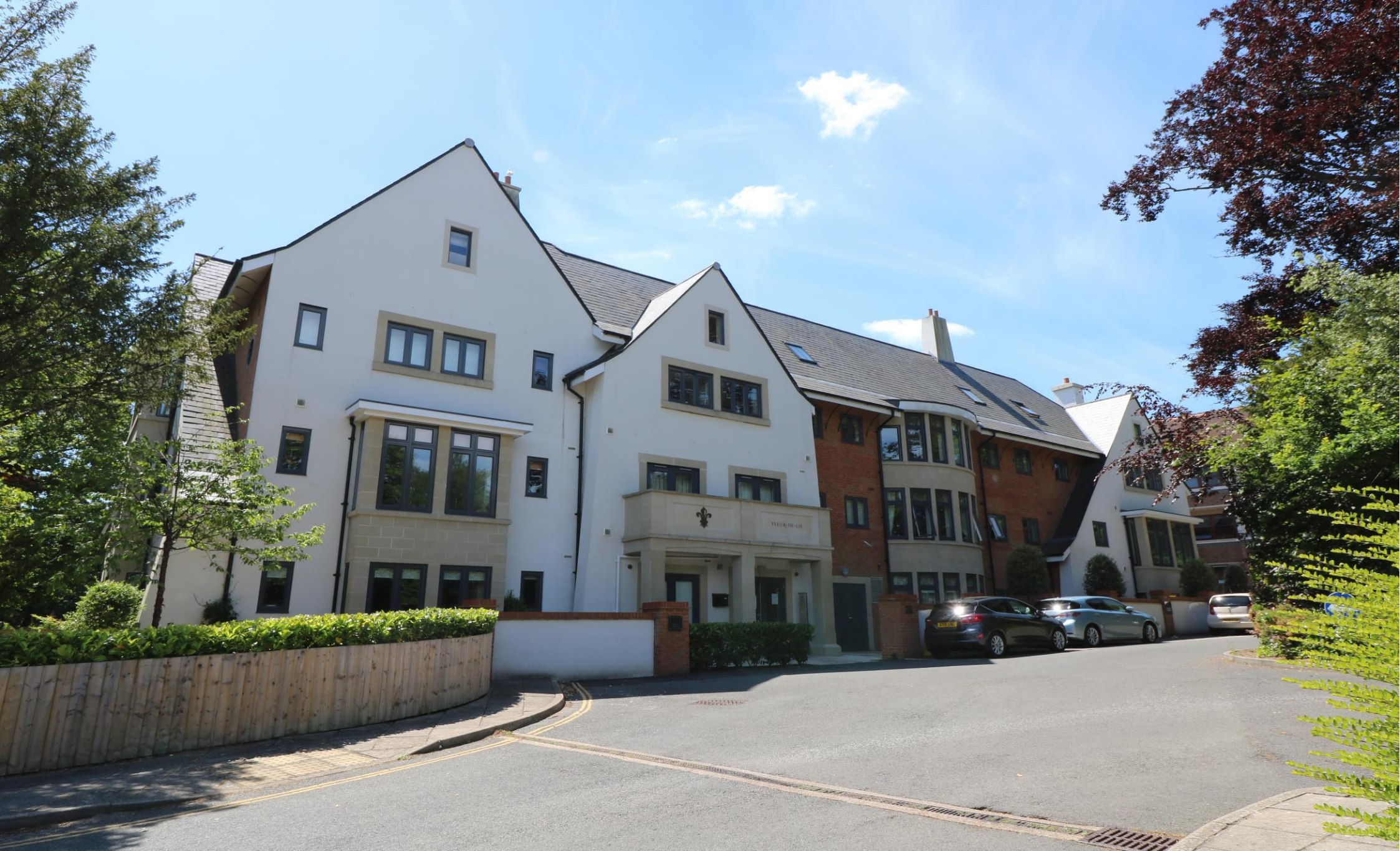
35 Fleur de Lis 2 Bolnore Road, Haywards Heath, West Sussex. RH16 4WH