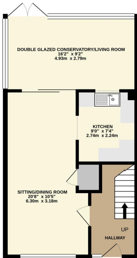
GROUND FLOOR 481 sq.ft. (44.7 sq.m.) approx.