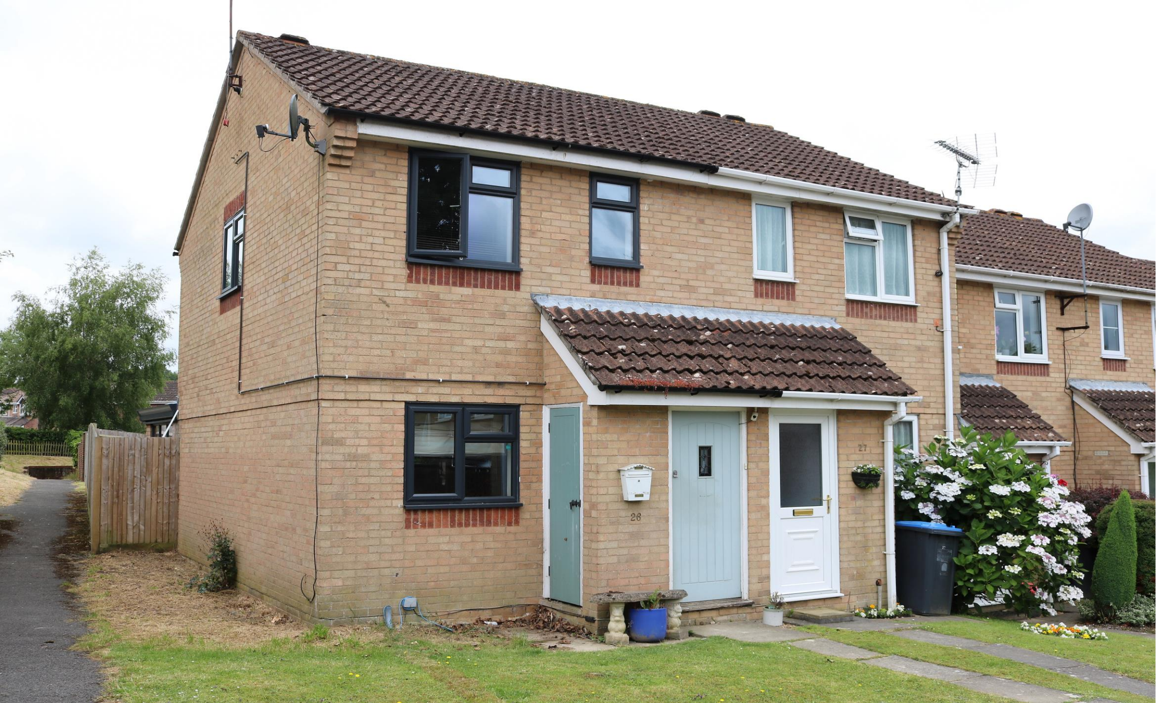
26 The Pines Haywards Heath. RH16 3TX