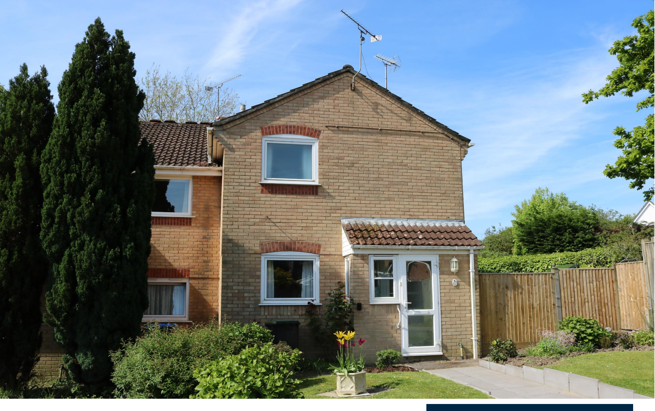
17 Cedar Way Haywards Heath, West Sussex, RH16 3TZ