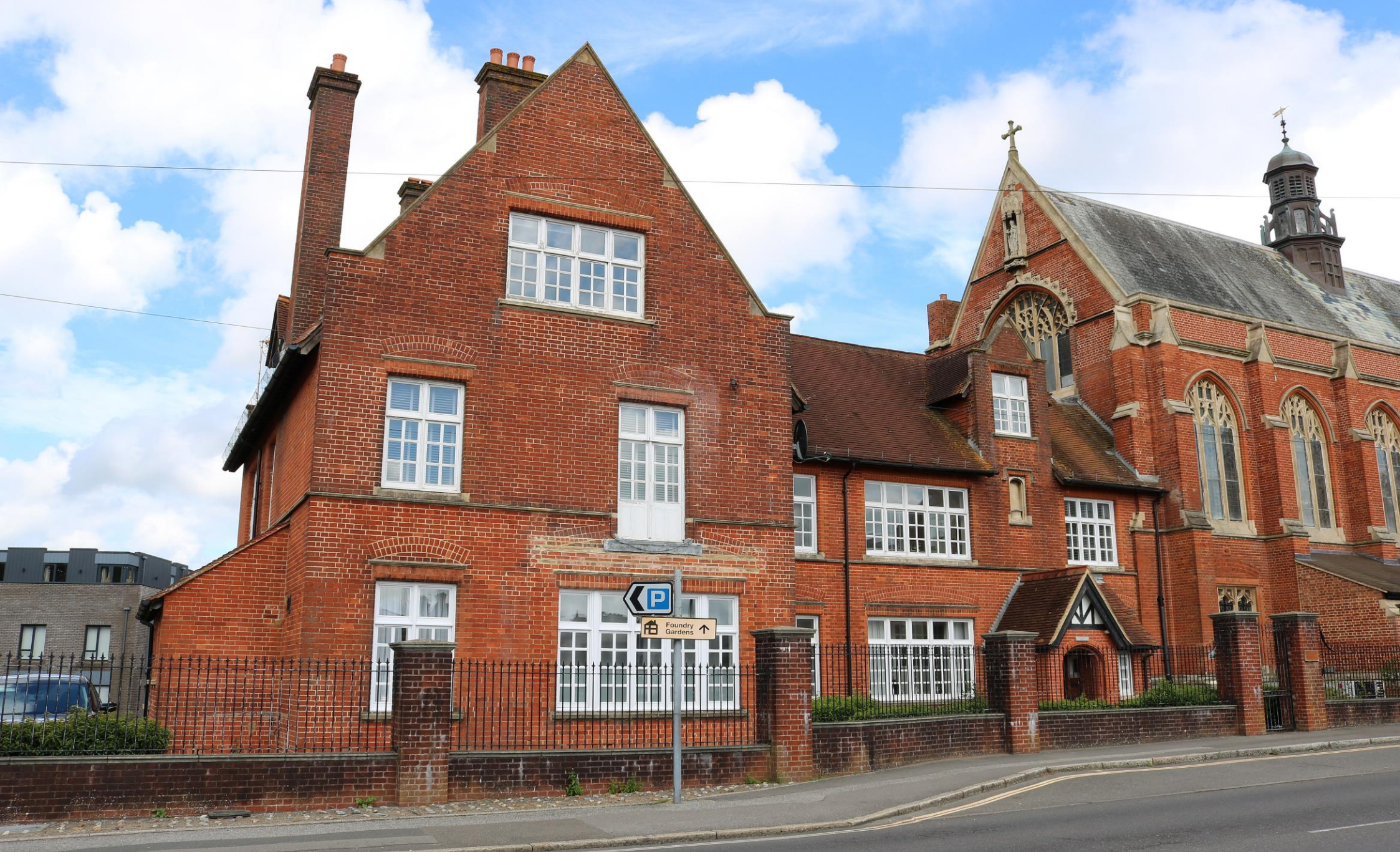
Flat 2, The Priory Syresham Gardens, Haywards Heath. RH16 3XB