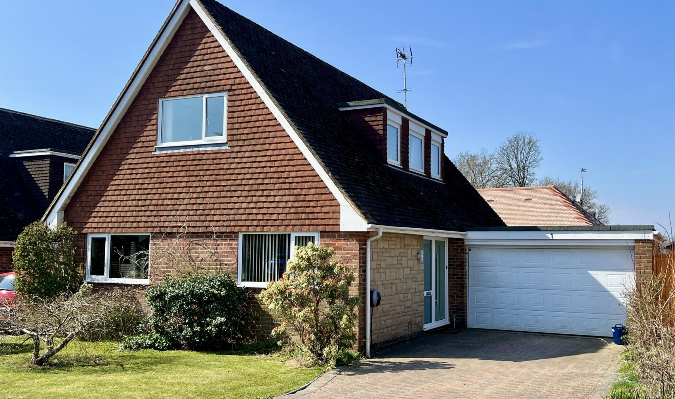
1 Janes Close Burgess Hill, RH15 0QH