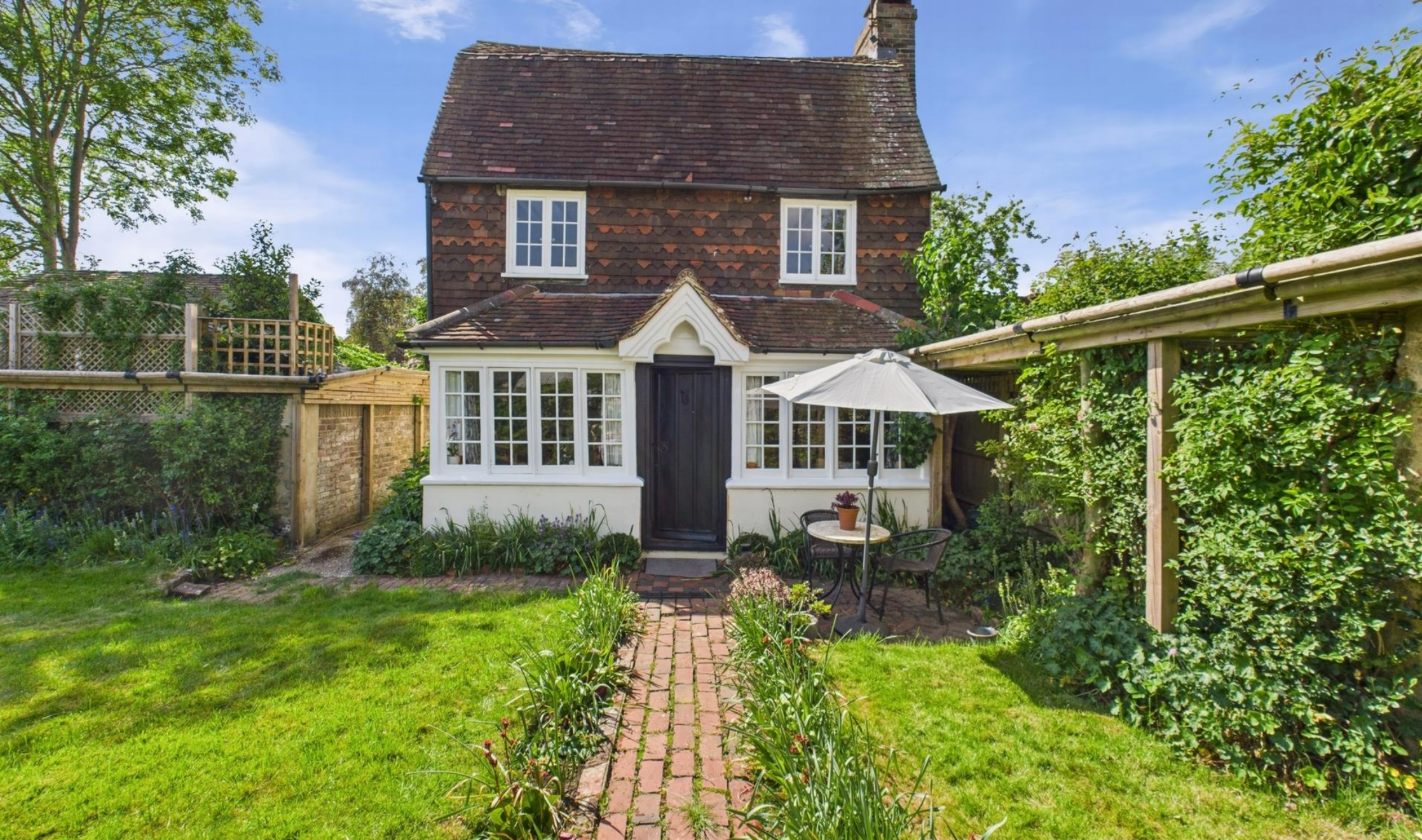
Mytten Cottage, Mytten Twitten High Street, Cuckfield, RH17 5EN