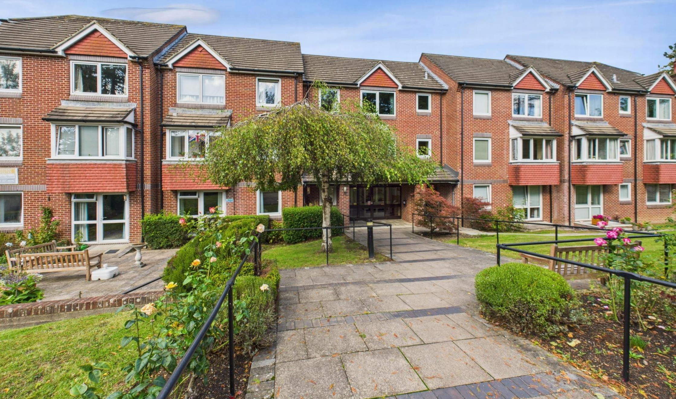
20 Heath Court Heath Road, Haywards Heath, RH16 3AF