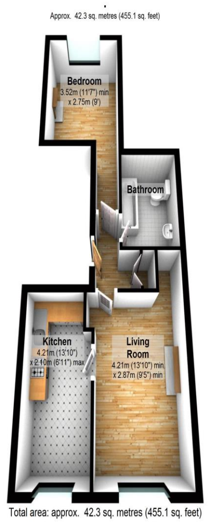
e to ensure the accuracy of this plan but all measures are approximate and for illustrative purpose only . No responsibility can be taken for any errors Plan produced using PlanUp.