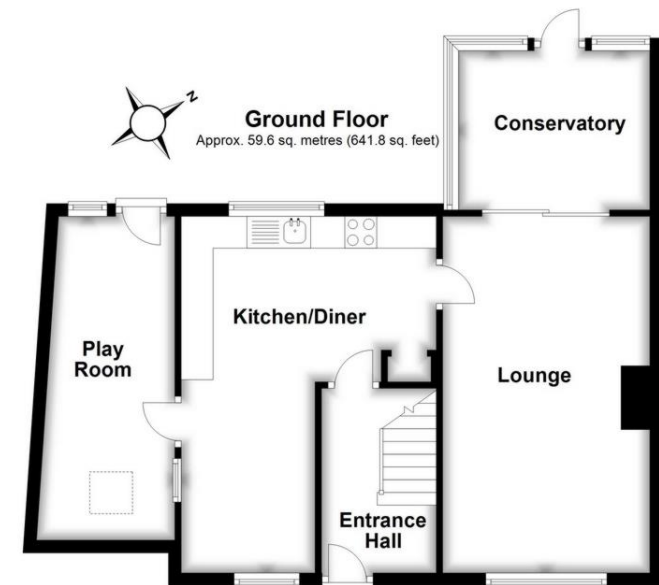
Ground Floor Approx. 59.6 sq. metres (641.8 sq. feet)