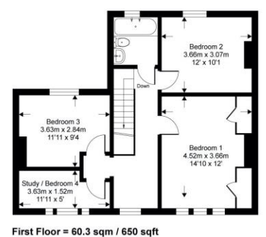
First Floor = 60.3 sqr