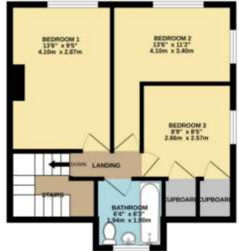
1ST FLOOR 419 sq.ft. (38.9 sq.m.) approx.