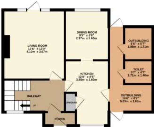
GROUND FLOOR 576 sq.ft. (53.5 sq.m.) approx.