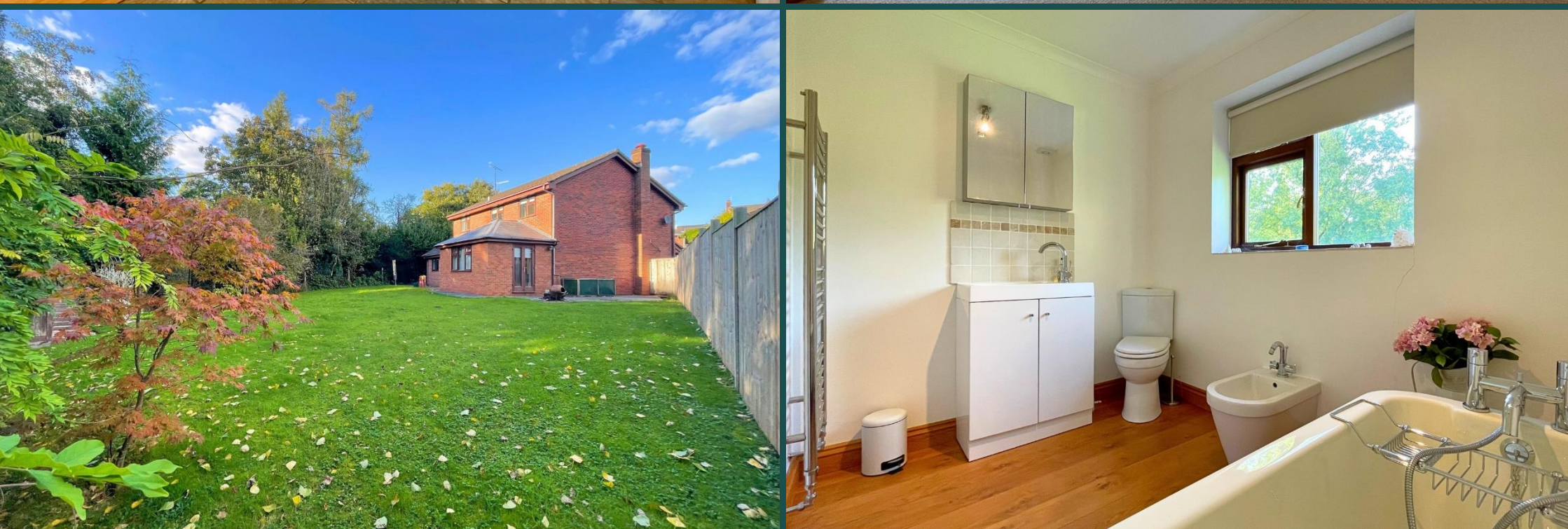
3 Agincourt Square, Monmouth, Monmouthshire, NP25 3BT