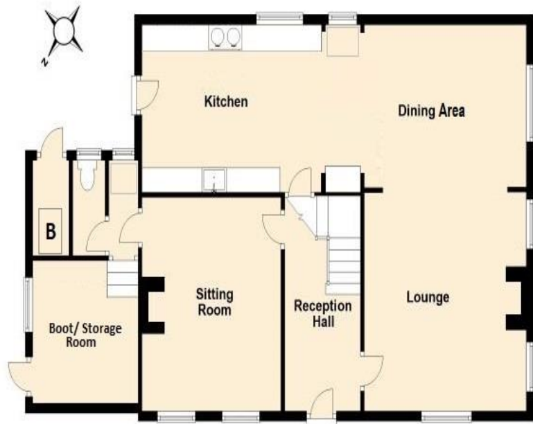
Ground Floor Approx. 95.2 sq. metres (1024.4 sq. feet)