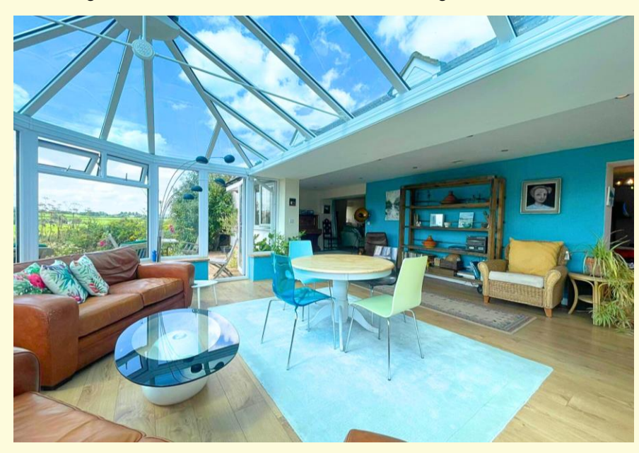
LIVING ROOM: 3.51m x 7.27m (11'6" x 23'10")

An impressively proportioned and incredibly light reception room glazed to all sides with climate controlled glass and an atrium roof. Doors to both sides out to gardens and sun terrace.