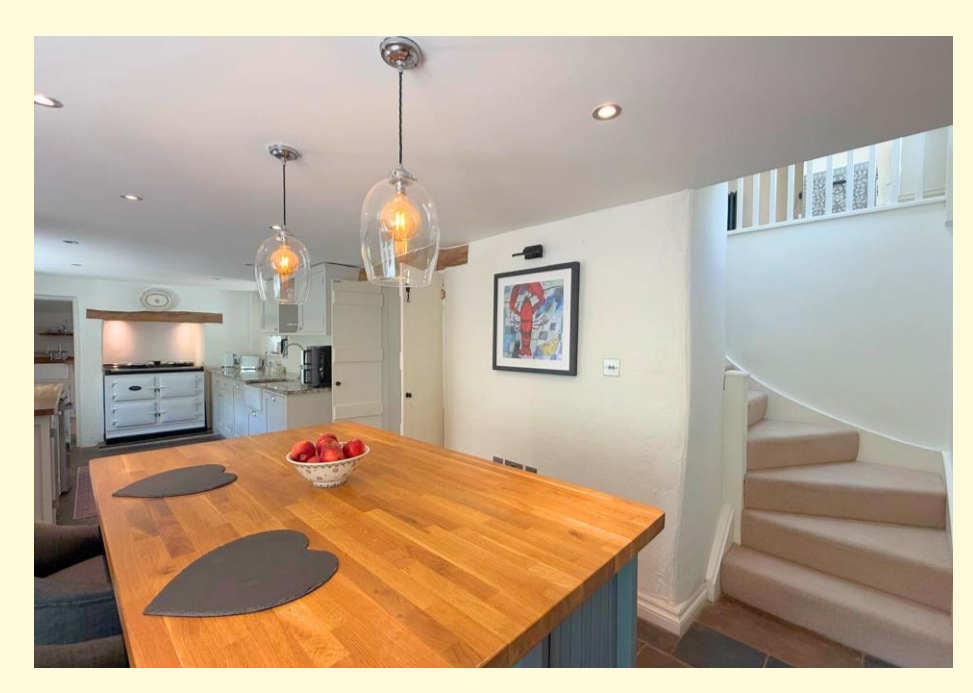
From kitchen/breakfast room up staircase to: