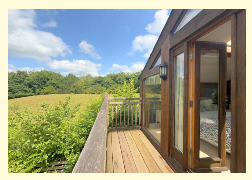
Asking price of £795,000

What3Words-///stumble.coverings.locating